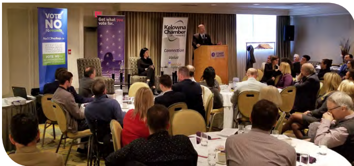
Debating proportional representation.

Advocacy is the heart of what keeps our Chamber engaged with members, government and the community. Our Policy Advisory Committee of the Board spends time reviewing both identified issues, and ad hoc concerns as they arise, seeking clarity and evidence-based decision making that helps us live up to our mission. We work closely with local and provincial chambers, the BC Chamber and the Canadian Chamber of Commerce.