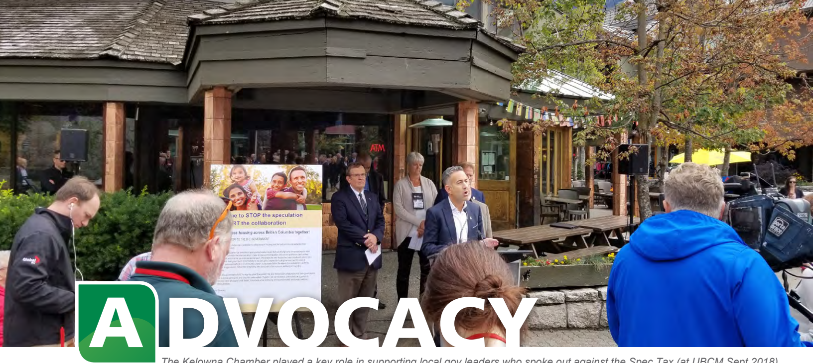
The Kelowna Chamber played a key role in supporting local gov leaders who spoke out against the Spec Tax (at UBCM Sept 2018).

Advocacy is the heart of what keeps our Chamber engaged with members, government and the community. Our Policy Advisory Committee of the Board spends time reviewing both identified issues, and ad hoc concerns as they arise, seeking clarity and evidence-based decision making that helps us live up to our mission. We work closely with local and provincial chambers, the BC Chamber and the Canadian Chamber of Commerce.