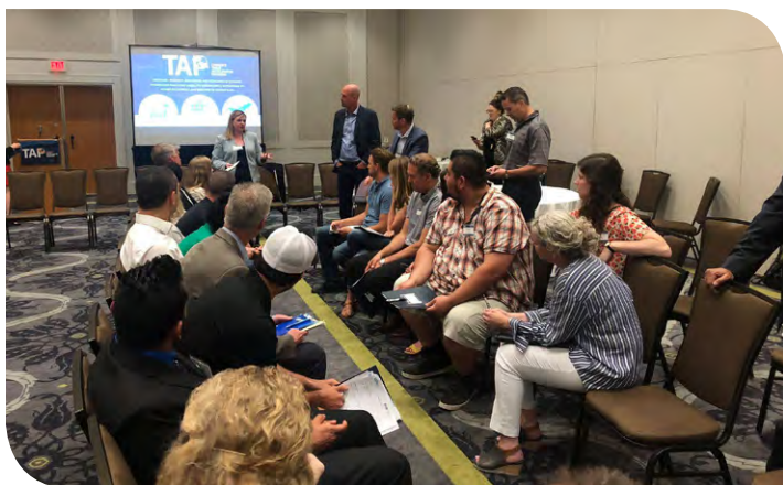
Chamber members attending the Trade Accelerator Program (TAP) brought to Kelowna by World Trade Centre Vancouver.