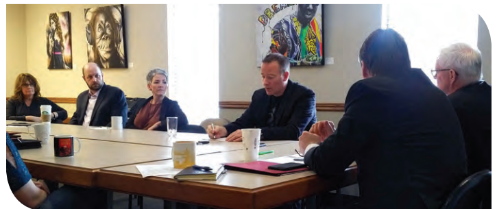
Stephen Fuhr MP Kelowna-Lake Country leads a roundtable at the Kelowna Chamber.