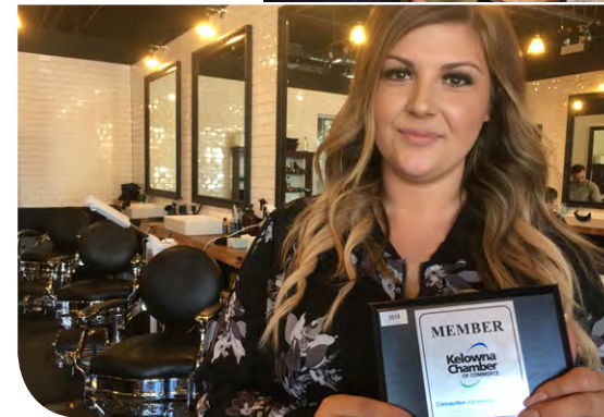
New members show off their official Kelowna Chamber of Commerce plaques.